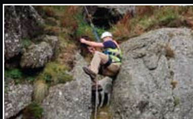
▲ You must be kidding!